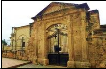
St. Paul's Church