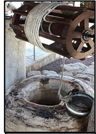
St. Paul's Well

Q: "When Will We Encounter Saul (Paul) Again According To Luke?"