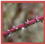
Common Rose Bush