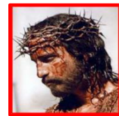
Our King’s Glory

Pilate Brings Jesus Out Again To Once Again Declare That He Still Finds No Fault In Jesus & Wishes To Set Him Free!