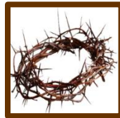
Crown of Thorns